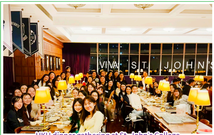
HKU dinner gathering at St. John's College