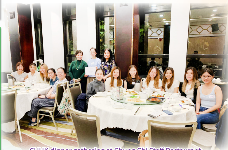
CUHK dinner gathering at Chung Chi Staff Restaurant

Taking a break from their busy schedules, old girls studying and working at the University of Hong Kong and the Chinese University of Hong Kong had dinner gatherings to catch up with old friends and meet new ones in March and April. Alumnae in Australia also met up in April for a dim sum lunch. After three years of social restrictions during the pandemic, it was especially enjoyable for old girls to chat, laugh, and cheer one another over a delicious meal.